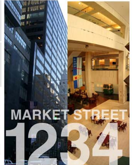
Program Highlight – Energy Star Award